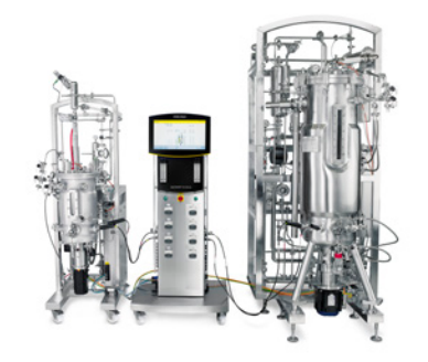
Biostat® D-DCU 10 - 200 L