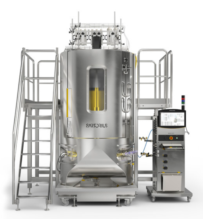
Biostat STR® 2000