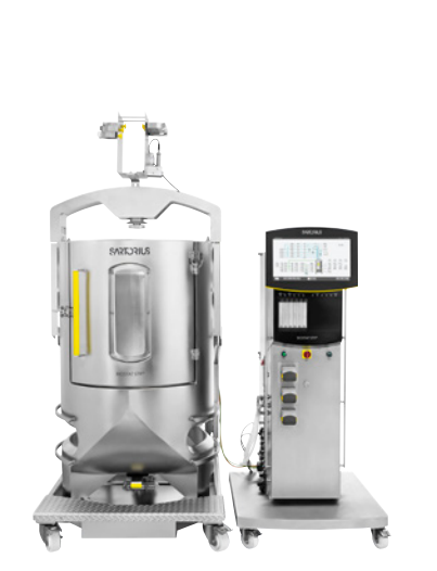
Biostat STR® 500