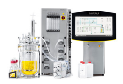
Biostat® B-DCU with Univessel® Glass 1-10 L