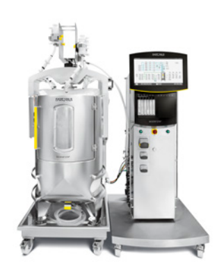
Biostat STR® 200