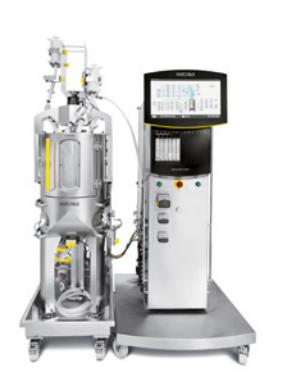
Biostat STR® 50