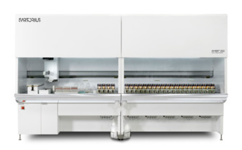
Ambr® 250 High Throughput