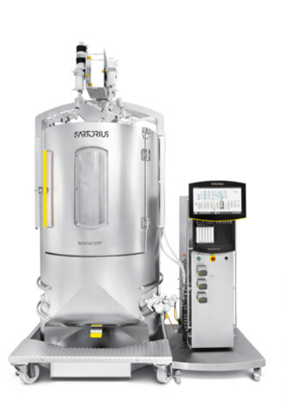
Biostat STR® 1000